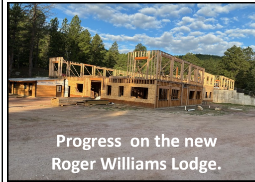
Progress on the new Roger Williams Lodge.

Psalm 33:3 references praising the LORD with playing skillfully on the harp. Psalm 108 is attributed to David. Verses 1-2 mentions praising the LORD with lyre and harp.