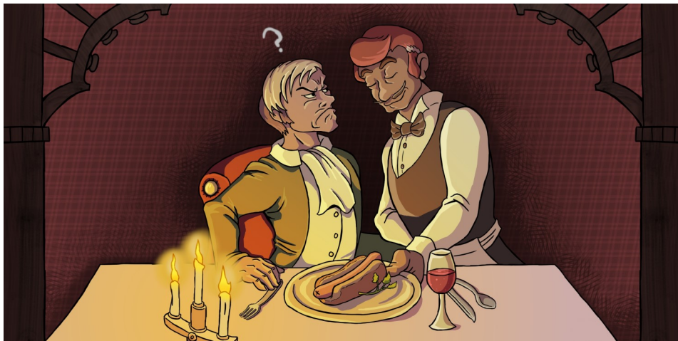
Images by James Best © http://jamesbest.net/artwork/sermon-illustrations-2024

D. Paul offered himself as an example of this behavior based on his following the example of _____.